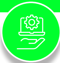
Microsoft 365 Management